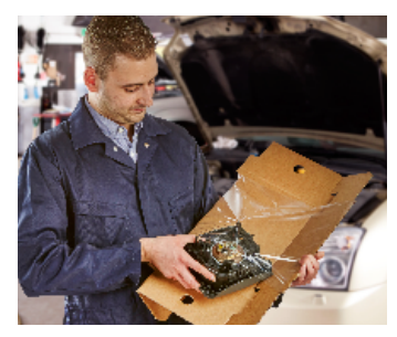
Shown: Korrvu retention package for automotive part