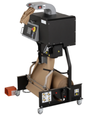
Shown: ProPad paper cushioning system with paper rollstock