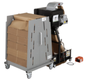
Shown: ProPad paper cushioning system with optional fanfold paper cart