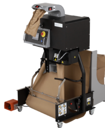
Shown: ProPad paper cushioning system with fanfold paper

The SEALED AIR® brand paper cushioning system increases fulfillment velocity with custom-length paper produced at up to 150 pads per minute, making it the fastest paper cushioning system on the market. It dispenses in manual, auto-repeat, and sequence modes to help meet your productivity goals, and is ideal for use in cushioning, wrapping, and blocking and bracing applications.