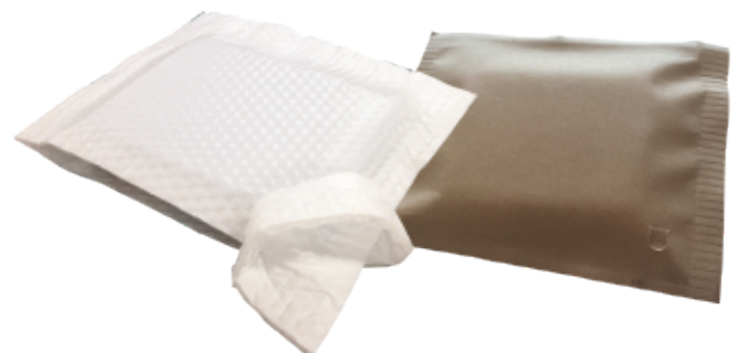
Shown: PriorityWrap® Bubble Laminate Mailer

The PriorityPack Automated Rightsize Mailer System encapsulates products in a cohesive-coated protective material that locks and seals the product in place to minimize shifting inside a ready-to-ship package. This innovative packaging solution improves productivity and labor efficiency by creating up to 14 packages per minute, compared to only one - three packages per minute when using manual packaging methods.