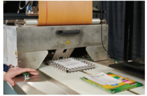
Shown: Products Entering the PriorityPack System